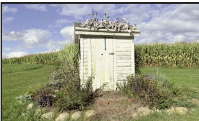
Facilities available for grinders