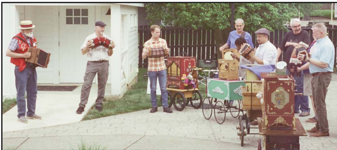
A MIDI Orchestra