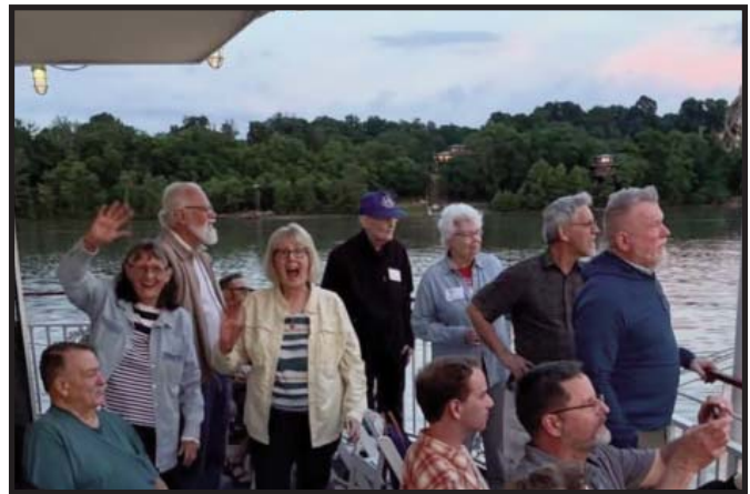
A Saturday evening boat ride

Howard Boatyard located on the banks of the Ohio River just across the street. The Howard Boatyard was known as the finest boat builders on the Western Rivers System building hundreds of steamboats