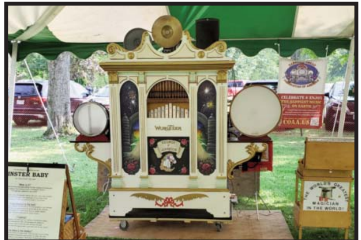
A Wurlitzer 146A Band Organ for the carousel.