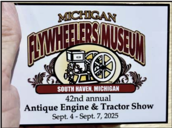
Engine & Tractor Show (& organ rally!)