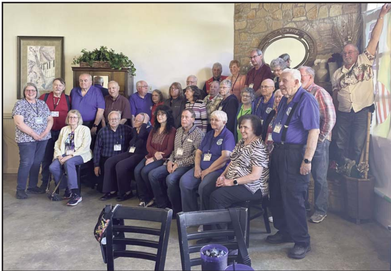
Organ Rally Attendees