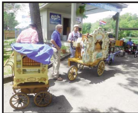
Getting ready for the organ concert.