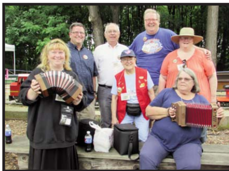
A group photo of attendees.

Each COAA registrant received two $5 coupons which could be redeemed at the Thresher's Kitchen on the grounds. Most were surprised to have the balance of their lunch purchase cost waived as a "thank you" for their contribution to the weekend's entertainment, and the tasty home-style meals were certainly well received!