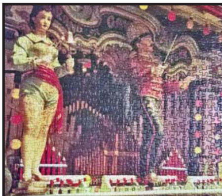
Not for sale, but interesting, was this Gavioli Fair Organ jigsaw puzzle.