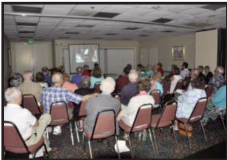
Attentive members enjoying the workshops.