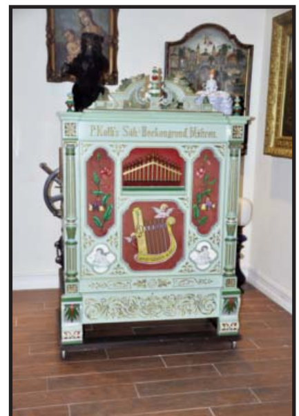
A 50 key Kolb & Sohn barrel organ in the Dvorak collection.