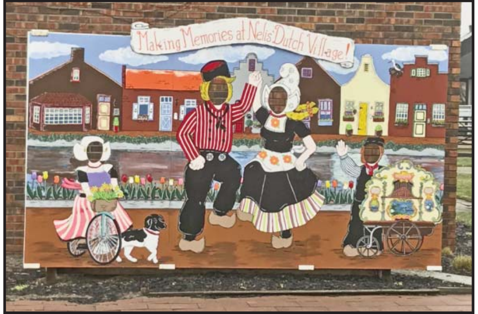
A favorite Dutch Village photo spot.

For the traditional dinner, we were served Bitterballen (deep fried minced-meat balls) and drinks for an appetizer and social hour, the main dish was Boerenkool Stampot met Worst (mashed potatoes with kale and sausage, skirt steak and gravy on the side), and Moorkopjes (eclairs/cream puffs filled with real hand-beaten whipped cream covered with hand-