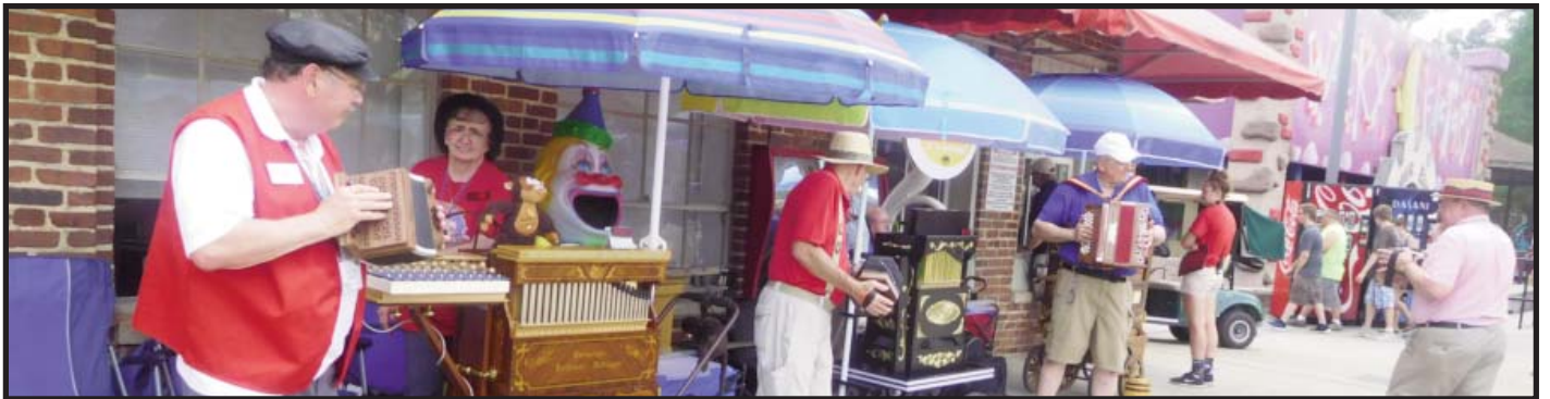
Grinders taking a break and participating in a group accordion/concertina ensemble.