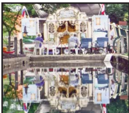
The Noordermeer's Cornelis Leendert as seen across a reflection pool.