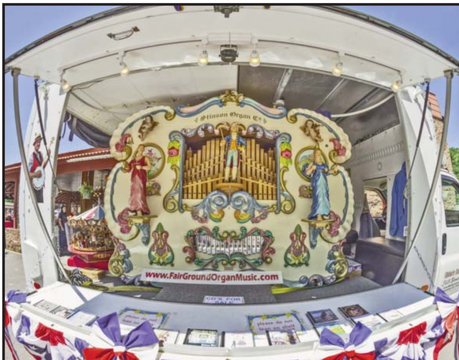
A fish-eye view of the Evarts' Stinson fairground organ.