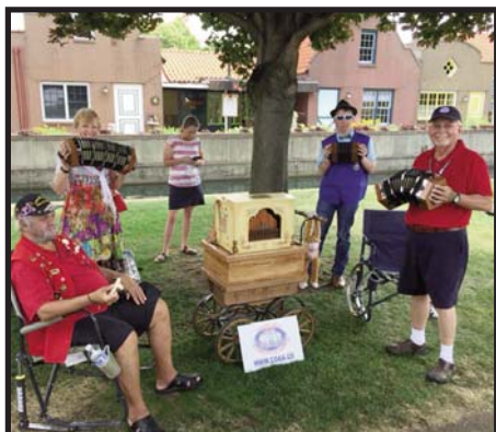
A group performance.