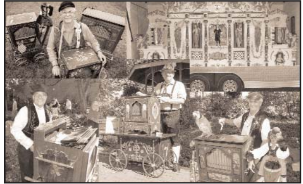
A poster collage used to illustrate what is coming to town.

rally—I’ve seen terms like muster, recall, festival and others used with equal success. Pictures or illustrations always help to define what is coming to town. I designed the poster for Weston and convinced the Chamber to print 100 copies for distribution in town and to attendees. If you’re lucky, maybe the Chamber will have a graphic artist. Go for it—the only challenge will be maintaining your personal discipline to meet deadlines.