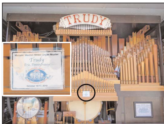
Name tags for participants can even be made for special instruments (see inset).

I highly recommend you personally meet with the Chief of Police. Provide him the same overview you've provided everyone else. Do not assume he is in the knowledge loop on the details of your event. It is here you can anticipate and de-conflict any potential issues with parking, street closures, and the need for parking cones, etc. The Chief will be pleased you coordinated with him as most event planners miss this step. Make sure he knows you are the 'go to' person for all rally related issues.