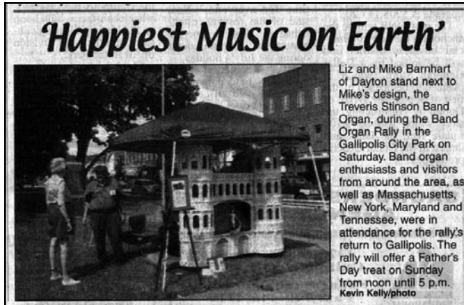
The Sunday's Times Sentinel , hometown news for Gallia and Meigs' counties.