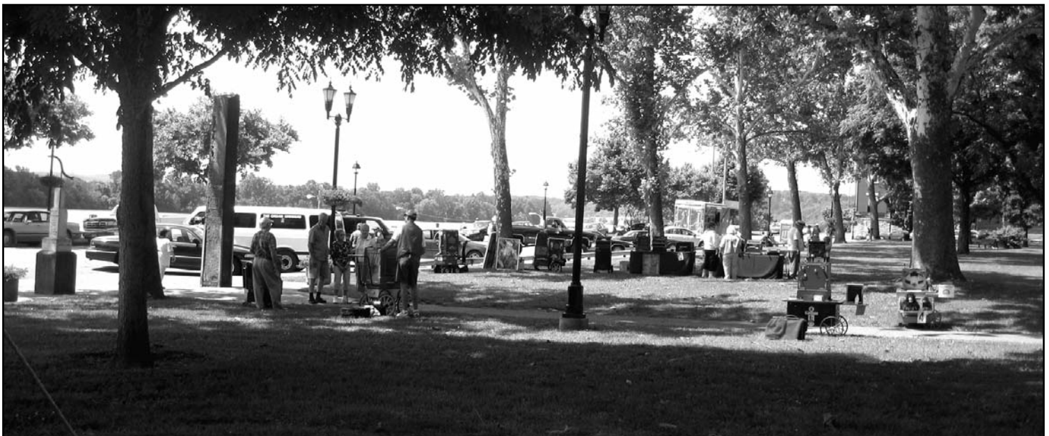
A widescreen view of "La Place" City Park where organs and their grinders played for the public.