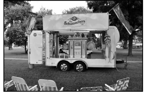
The Schumacher organ: a beautiful Wurlitzer 146.