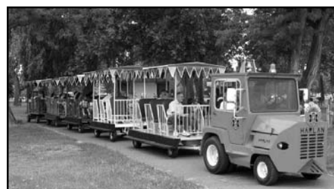
The JS Express train.

A small rubber-tired train, (the JS Express) brought young and old from the Playground of Dreams (a large children's play area) to hear the music.