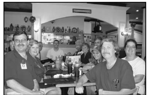
COAA members eating dinner at one of the local restaurants.