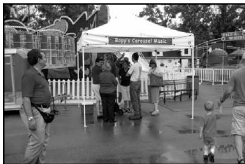
The heavy rain forced many members to the Bopp's canopy.