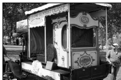
A Wurlitzer Caliola on an antique truck.