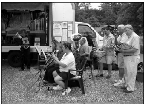
The COAA band ensemble with additional percussion section.