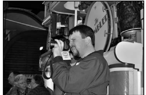
So many organs, so little time to photograph!