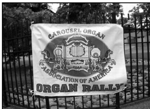
The COAA Banner at Lake Winnie.

Once again, all of the hand-cranked organs were featured in special concerts down by the Lakeside Stage,