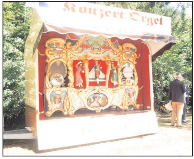
Figure 7. A 70-key Wellershaus fair organ brought by the Ballman family.