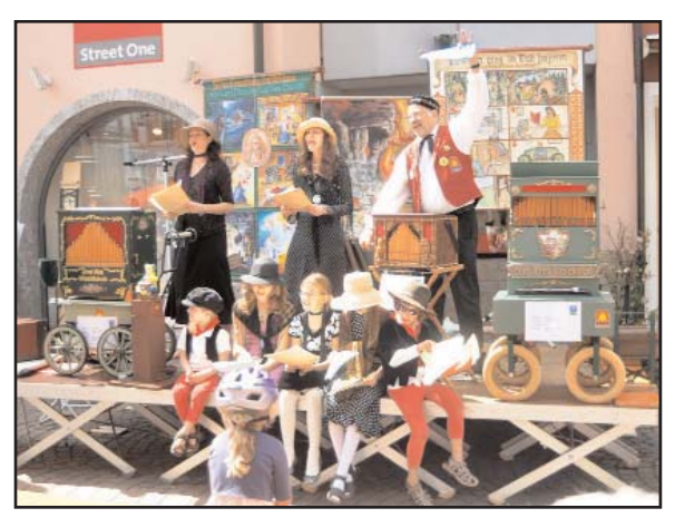
Figure 11. A group of moritot singers brought large crowds of onlookers.

Opening ceremonies in the late afternoon were held in front of the Elztalmuseum in Waldkirch with official speeches, hand-organ playing and of course, consumption of the local brew occurred. The featured organ outside was a 90-key Dutch street organ, De Lekkerkerker (see Figure 9, "Remembering Carl Frei" in this issue).