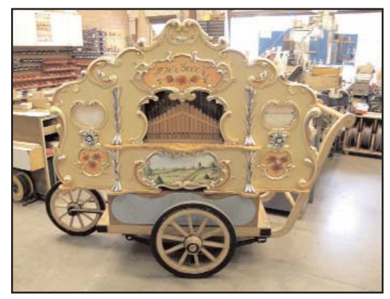
Figure 19. A new 45-key street organ manufactured by Johnny Verbeeck.

The following morning the group traveled to Brasschaat, Belgium. An afternoon late lunch was followed by a visit Johnny Verbeeck's workshop in St. Job in t Goor. Many large machines were various