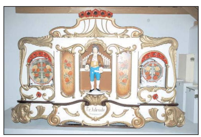
Figure 5. A 59-key Wrede fair organ in the Schwarzwald Museum in Triberg, Germany. This large organ can be hand-cranked.