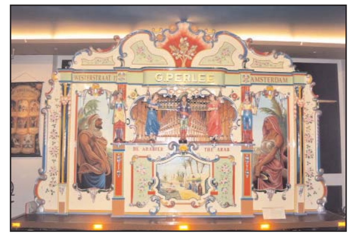
Figure 31. The Arab , a 75-key Perlee organ, originally built by the Verbeeck company. It is in the Speelklok Museum in Utrecht, Holland.