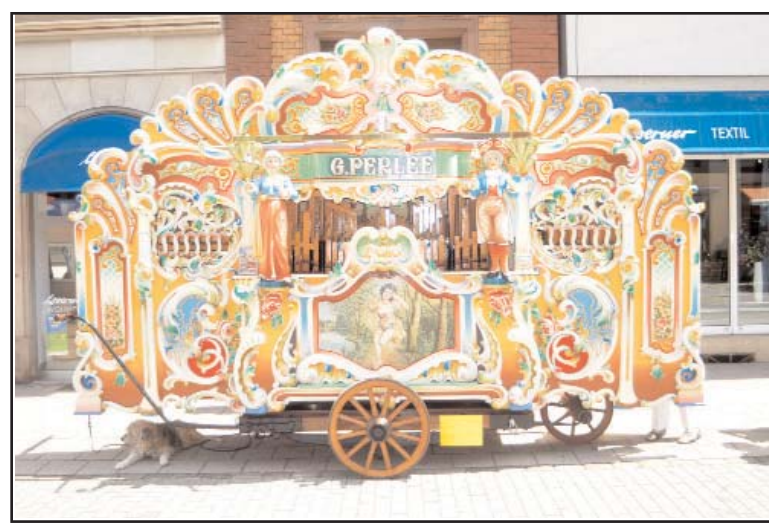
Figure 10. A Perlee organ built by Carl Frei and brought by the van Leeuwen family from Amsterdam. Named De Pod it is a favorite of the Waldkirch Orgelfest, appearing in several previous rallies.