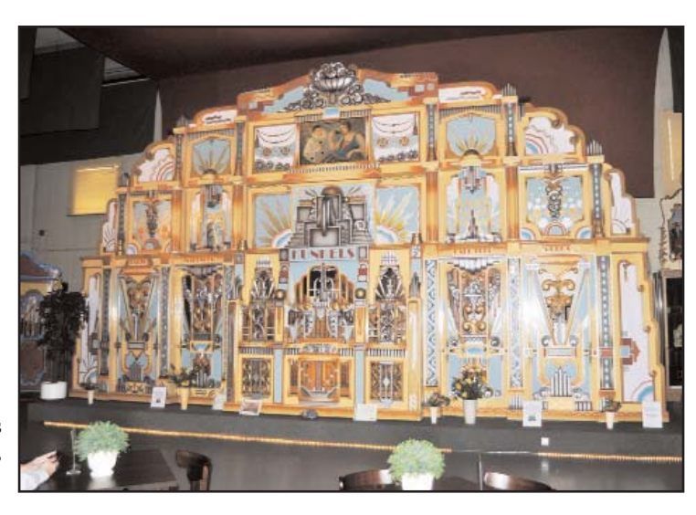
Figure 32. The Kunkels organ, a 112-Marenghi/Frei organ is the centerpiece of the Kunkelstichting Museum in Haarlem, Holland.

This has been a brief report on the organs visited, photographed, videoed and appreciated in the 2011 Bumbling Bruder Tour. All of our visits and tours were as a result of our European friends and it would be amiss for me not to acknowledge them at this time. Figure 33 is a collage of those contacts that helped make the tour a success.