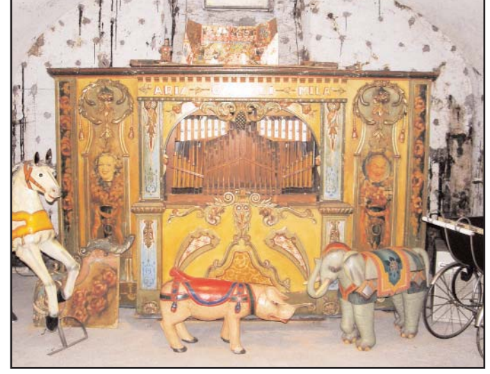
Figure 17. An unusual Gavioli organ in the Fredy Kuenzle collection.

stages of repair but we also viewed representative samples of new, smaller book-operated organs ( Figure 19 ). That evening was spent enjoying the collection of Danny DeBie in Balen, Belgium. Many large orchestrions, dance organs and a Style 6 Welte were featured