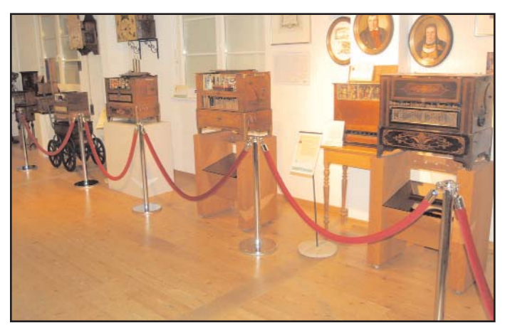
Figure 1. A portion of the Waldkirch Organ Foundation collection of hand and barrel organs.

Tourist activities were not forgotten as the group first headed to "Rüdesheim am Rhein" (Germany) and enjoyed the hospitality of Siegfried Wendel and family. Viewing the Wendel collection, taking a chairlift ride to the Neiderwald Monument or enjoying a Rhine River cruise, and dining out in the "Drosselgasse" were just some of the activities to jump-start the trip.