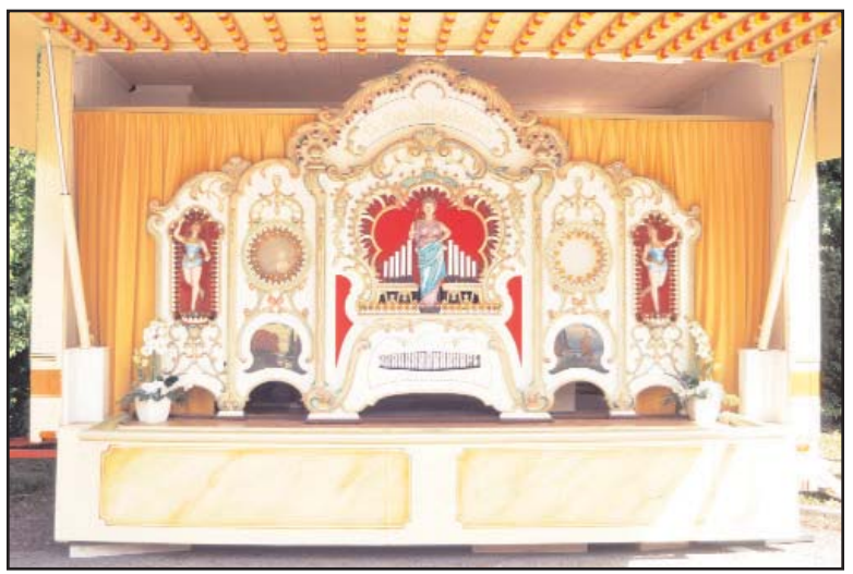
Figure 8. A Model 35 Ruth organ in the collection of the Hinzen family. They brought three organs to the Orgelfest in Waldkirch.