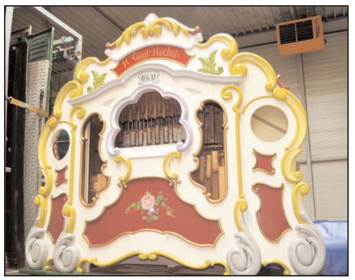
Figure 27. A Model 33 Voigt fair organ in the Hinzen collection.

The following day many of the tour members traveled to Amsterdam for more tourist-like activities but a few of us "can't—get-enough-of-organs" members persuaded our driver to take us to the Hinzen collection of organs. Boasting over 25 fair organs (all used with their carnival rides) we were able to see just a few, the most memorable being the large Style 38 Ruth ( Figure 26, centerfold ). In the years past there has been a Style 38 Ruth present at the Waldkirch Orgelfest but this year's celebration was void of such an organ, so this was a treat to see and listen to this magnificent organ. Amongst their stable of various models of Ruth organs was a fairly uncommon organ, a Model 33 Voigt which had been converted to play Ruth music ( Figure 27 ). It is a compact organ but still useful for a small carnival ride.