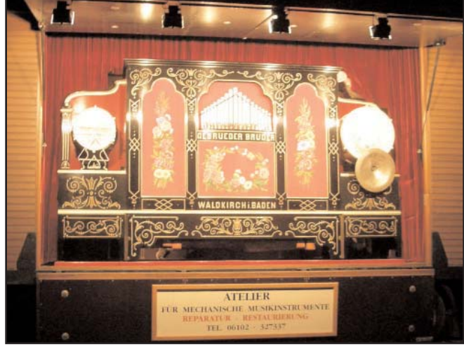
Figure 18. An unusual case style seen in this Model 109 Gebr. Bruder of Tom Richter, Neu-Isenberg, Germany.