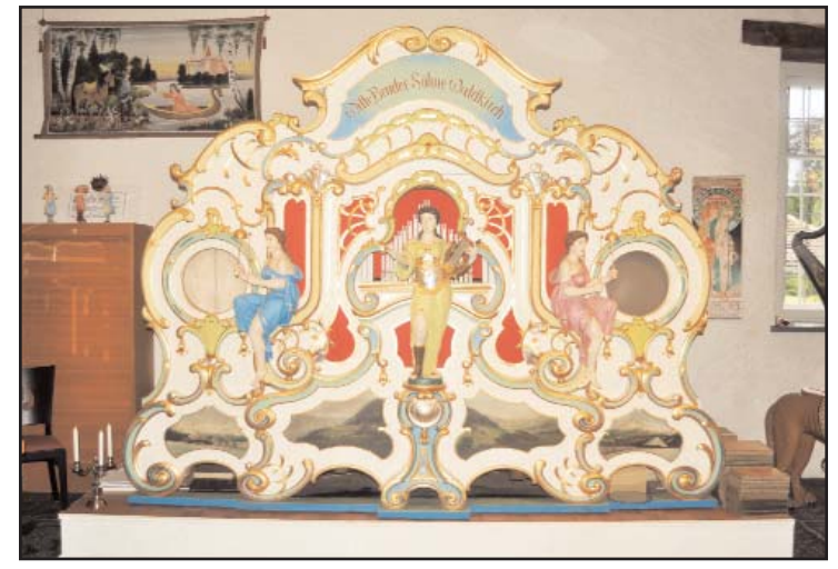
Figure 15. A 62-key Wilhelm Bruder in the Matter collection in Oberhofen, Switzerland. Note the heavily carved facade.