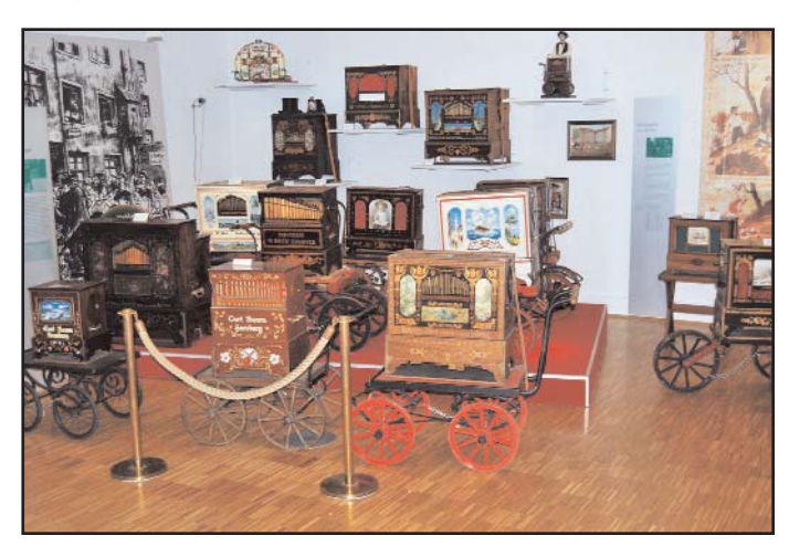
Figure 4. A view of some of the many hand-cranked barrel organs featured in the Schwarzwald Museum in Triberg, Germany.

The morning of the tri-annual Waldkirch Orgelfest gave the COAA group a chance to visit the cuckoo clock capital of the world, Triberg, Germany. An outstanding attraction, especially for those with our specialized interest, is the Schwarzwald Museum. The museum holdings consist not only of clocks made in the area but also nearly 200 hand organs ( Figure 4 ) and one well-preserved hand-cranked 59-key Wrede fair organ ( Figure 5 , centerfold ).