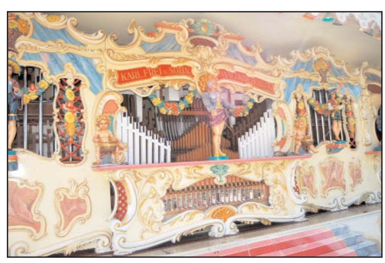
Figure 14. The immense 125-key Carl Frei organ that sits in front of the show-room of Swiss collector/dealer, Hanspeter Kyburz.