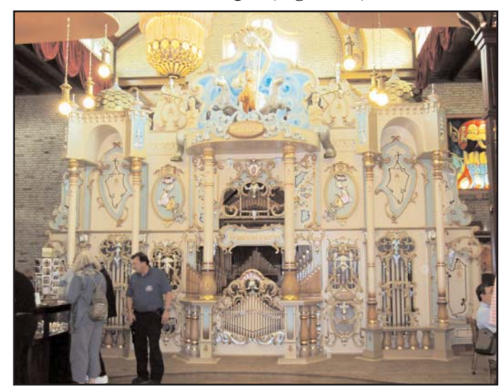
Figure 25. The Poseidon , a 101-key Mortier, is a recent addition to the van Laarhoven collection. Originally equipped with a different facade and called de Visjes (the Fishes) it has been recently restored. It was originally constructed in 1929.

Most of his organs have been covered by previous tours (105-key Robot Decap, 50-key Limonaire street organ, 61-key Marenghi and 101-key Decap with the exception of a new Mortier dance organ ( Figure 25 ), the Poseidon .