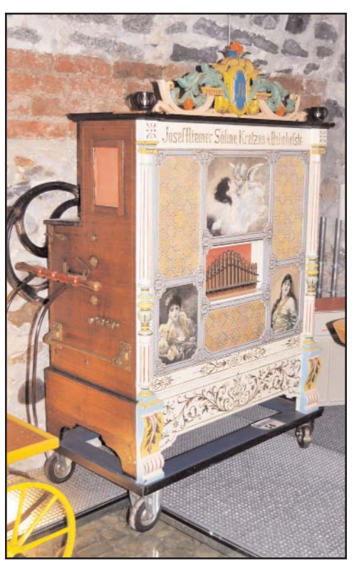
Figure 16. A 45-key Riemer barrel organ—a neat mechanical instrument from Czechoslovakia.