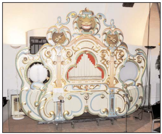
Figure 3. A 48-key Wilhelm Bruder (Model 79) in the basement of the Elztalmuseum in Waldkirch.