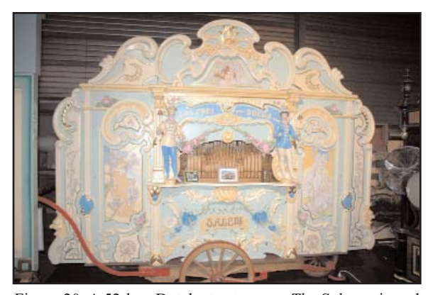
Figure 20. A 52-key Dutch street organ, The Salem , viewed in the Henry Krijnen collection.