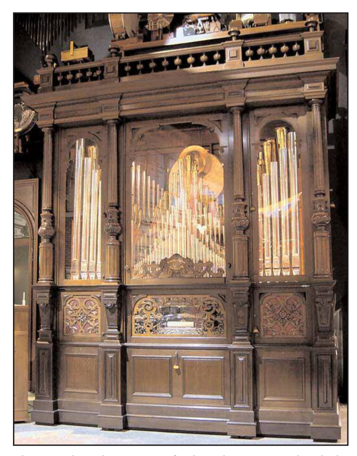
Figure 5. The replacement case for the Welte Wotan was done in the classic style, as featured on cottage and concert orchestrions, as well as other Wotans.

The Wotan was essentially abandoned in place until acquired by Howard Hynne of South Milwaukee, Wisconsin in 1963. He learned about the orchestrion through an old piano man. The case may have been beyond salvage as Hynne did not take or get it with the exception of a few components. Hynne immediately impressed park personnel on his first visit, when he started to pick up rolls that had been scattered across the floor, showing an interest in the preservation of the big instrument even before he owned it.