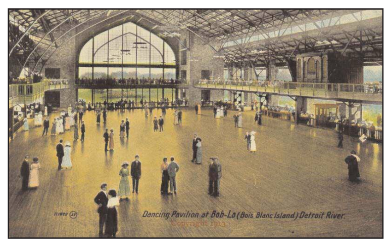
Figure 4. The Welte Wotan in the Milhous collection was housed in a huge, simply decorated case on the balcony when it furnished music for the immense dance pavilion at Bois Blanc park.

About 1910, the firm designed a series of "Eisbahn," or skating rink, orchestrions, marketed in the U. S. as "Brass Band Orchestrions." The available models included the "Donar," "Walhall" and "Wotan." The last was the largest and most powerful of the style. These instruments were built and voiced for use in skating rinks, but could also be used in dance halls, carousels and in outdoor concert service in amusement parks. They supported the recreational activities that were proliferating in the first decade of the 20th century.