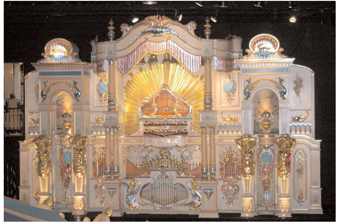
Figure 10. Placed on an elevated platform, the 125-key Gaudin-Verbeeck dominates the main room of the Milhous collection.

than those of Gavioli and Limonaire. As the market for instruments waned late in the first two decades of the 20th century, Marenghi also commenced to build some very large dance hall organs, up to 106keys, for Belgian buy-Upon his 1919 ers. death, the business was continued in the same location by the Gaudin brothers. They rebuilt a number of Marenghi instruments and also fabricated a number of very large dance organs for Belgian halls, perhaps up to 116-keys. An organ of the latter scale is reportedly in the possession of a showman's family in France. There was lively competition amongst