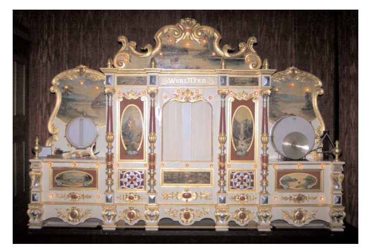
Figure 13. The Wurlitzer 157 in the Milhous collection has been seen in the Midwest, the far West and now Florida, making it a well-known instrument.

1922, the sixth and last organ designed by Wurlitzer staff to play the same roll. The last 157 was shipped in 1929, with about nineteen constructed in total, of which at least seven survive today. As a curiosity, the last 165 shipped in 1939 was also furnished with a 157-style façade. Wurlitzer 157s were most frequently sold for carousel applications and for that reason were fitted with a duplex roll frame so that there was never a moment without music to attract and entertain riders. Figure 13 and back cover.