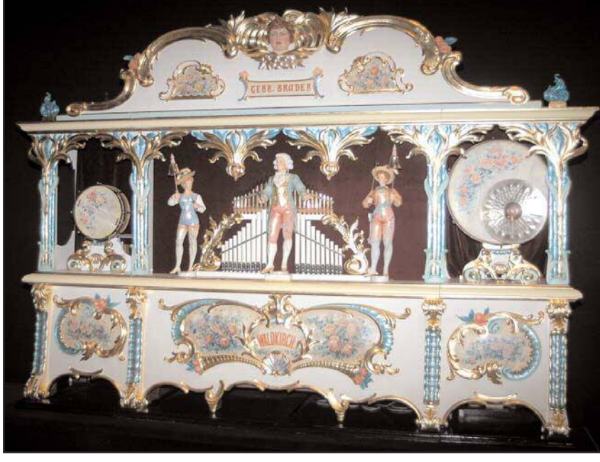
Figure 2. The Model 104 Gebr. Bruder in the Milhous collection is a very original instrument, from the internal pipework to the decorative scheme on the façade.

and accepted by showmen. A. Ruth & Son of Waldkirch, Germany, countered with a keyless, pneumatic control system in 1900. The first instrument they built as a book organ was a 76-keyless Model 36. The largest Waldkirch Gebrüder firm, Bruder, is thought to have made their first book organ around 1902. By then they were selling their Model 104, 76-keyless instrument, essentially an equivalent to the earlier Ruth. The initial 104 Bruder