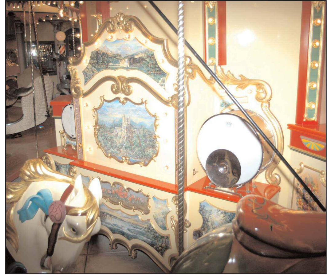
Figure 12. Music for the Milhous collection carousel is furnished by a Wurlitzer 153 that served most of its working life with a railroad carnival

The heritage of the Milhous 153 dates back to a large railroad carnival, the S. W. Brundage Shows. The operation commenced around 1905, with a continuation through 1932.