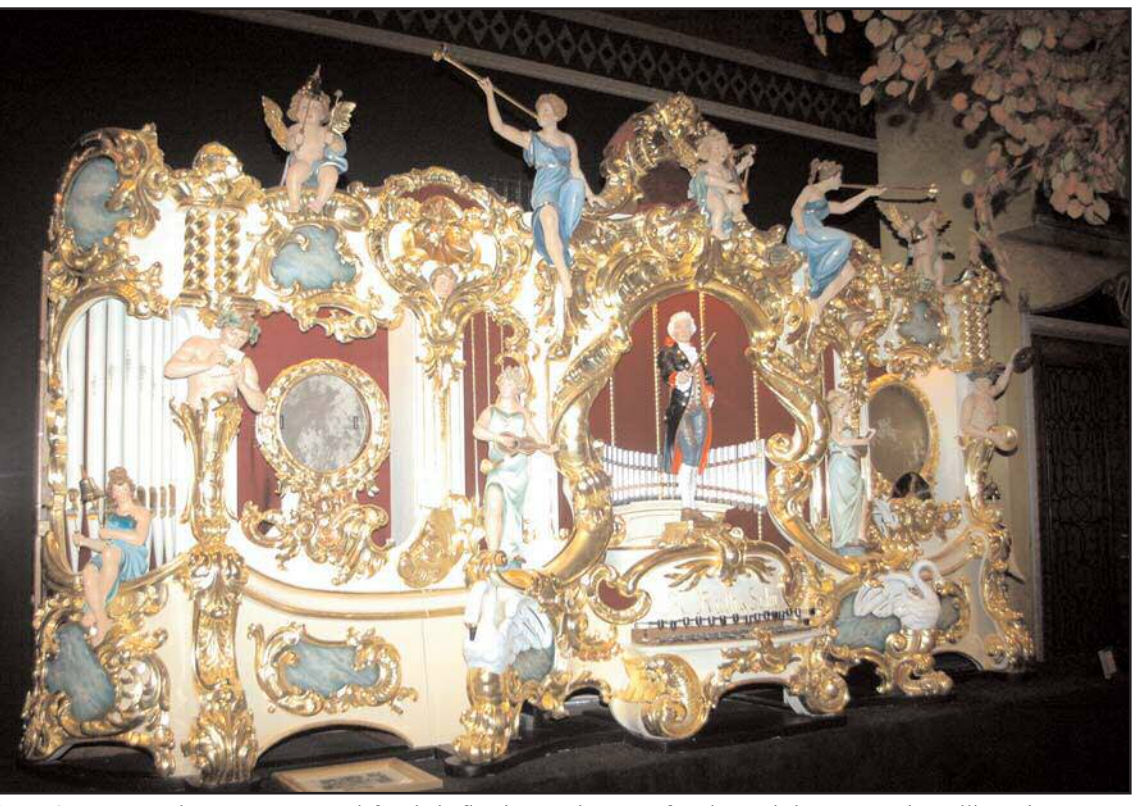
Figure 3. Large Ruth organs are noted for their flamboyant baroque facades and the one on the Milhous instrument exemplifies the style in grand form.

The Milhous organ was the first Model 37 Ruth constructed, in 1901. It was the bookoperated version of the 90-key Style 24 cylinder organ. Fourteen were reportedly built between 1901 and 1927, of which about half survive today. It