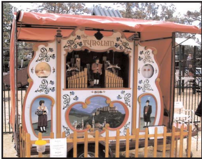
Figure 6. A large Australian-built organ, The Tyrolian .

Saturday was dry, which was good for an organ rally. The owners of the hand-cranked organs ( Figures 3 - 5 ) set themselves up in one of the old streets and the larger organs ( Figures 6 - 8 ) on a lawn area facing the paddleboats and the river. The lovely old time music floated over the whole area, including the river, creating a wonderful atmosphere. Saturday evening was spent cruising the river on an old steam paddleboat Canberra of which we were the exclusive guests.