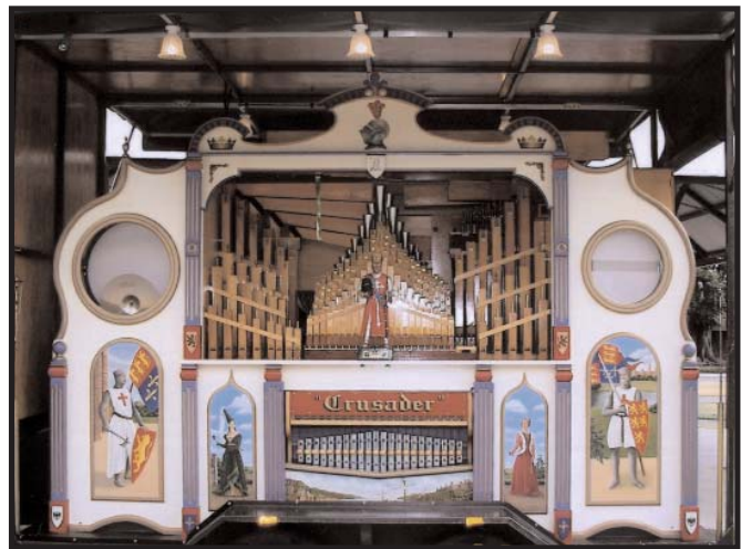
Figure 8. The Crusader is another Australian-built organ.

The 2008 rally was a success and we all look forward to next year when we can catch up with each other again.