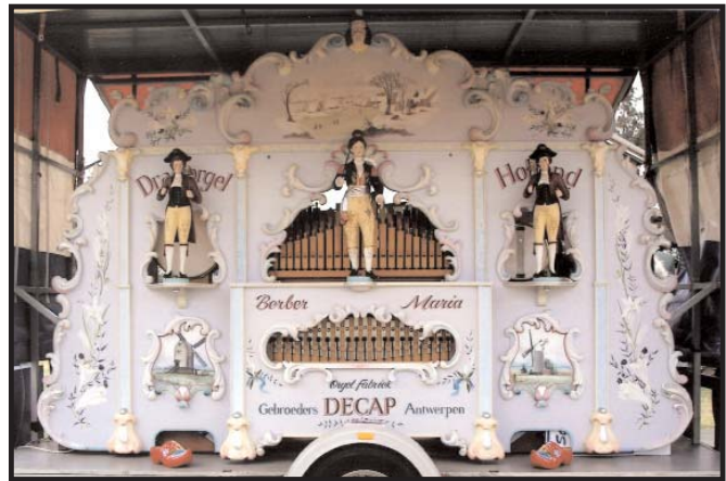
Figure 7. The Dutch street organ, Berber Maria , was built in Belgium by Decap for an Australian owner in the 1990s.