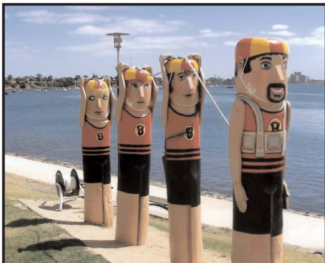
Figure 2. Four of 103 painted wooden sculptures on the Geelong waterfront.