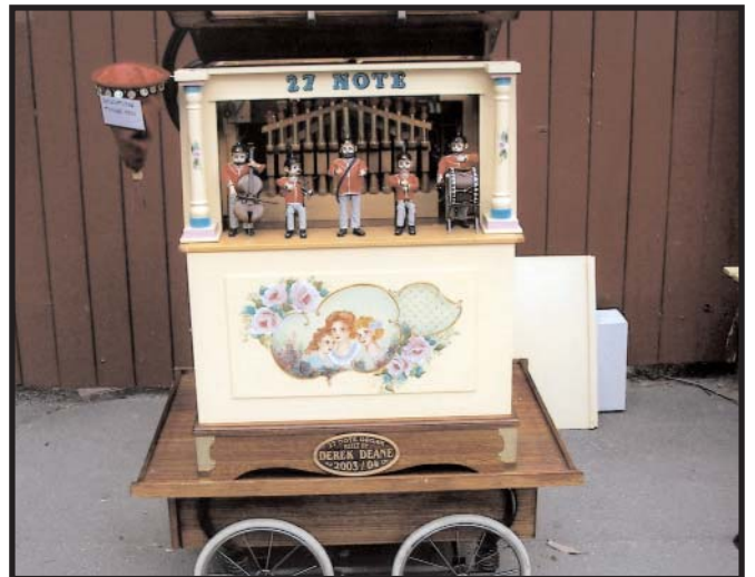
Figures 3 (above) and 4 (below). An Australian-built hand organ. Each figure moves with the music.

The wharf area has a street with old-style buildings where we set up our organs on the weekend of the 8th and 9th of November 2008. The atmosphere was excellent because everything belongs to the same era. Friday evening it rained; but no one complained as we have had a bad drought.