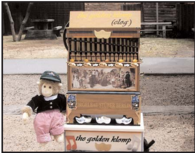
Figure 5. A Stuber hand organ called The Golden Klomp .

Saturday was dry, which was good for an organ rally. The owners of the hand-cranked organs ( Figures 3 - 5 ) set themselves up in one of the old streets and the larger organs ( Figures 6 - 8 ) on a lawn area facing the paddleboats and the river. The lovely old time music floated over the whole area, including the river, creating a wonderful atmosphere. Saturday evening was spent cruising the river on an old steam paddleboat Canberra of which we were the exclusive guests.