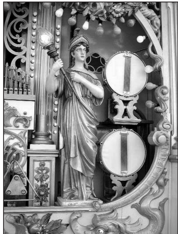
Figure 4. Art nouveau figure, lights, and percussion on White's 1909 Royal Coliseum 112 key Gavioliphone.

My secret vote for "heaviest hitter" went to "The Rose" (Figure 5). This is a 110-key Marengi & Cie. organ, carrying the J. Verbeek name as well. In her most recent re-