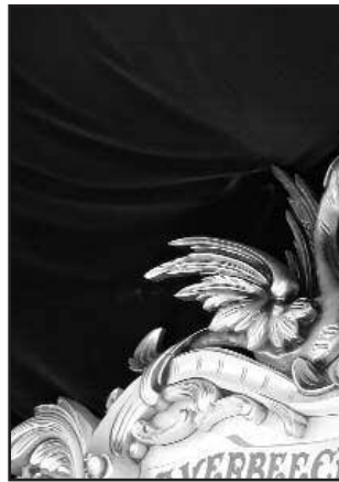
Figure 3. Dancing the Can-Can to music from a 98-key Gavioli.

The "heavy artillery" was parked in the middle of the open sports ground. I counted four huge Gaviolis (Figure 3) and two very large Marengi & Cie. organs. One was the White Brothers 1909 Royal Coliseum Gavioli (Figure 4) which Herb Brabandt photographed at