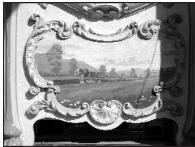
Figure 6. High quality carving and a English country scene on a small organ.

I was impressed by the variety of carving and decorating styles on the organ fronts (Figure 6). The figures included the classic conductors and bell ringers which I’ve seen on organs in America, interesting art nouveau females, some slightly more risqué females, and fanciful animals. Metal-flake paint and lights figured in many of the designs.