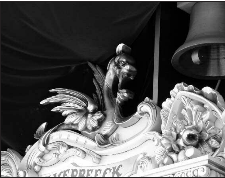
Figure 5. Metallic flake paint dragon and large bell on “The Rose,” a 110-key Marenghi.

I was impressed by the variety of carving and decorating styles on the organ fronts (Figure 6). The figures included the classic conductors and bell ringers which I’ve seen on organs in America, interesting art nouveau females, some slightly more risqué females, and fanciful animals. Metal-flake paint and lights figured in many of the designs.