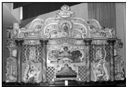
Figure 7. De Schuyt , a 105-key Carl Frei dance organ premiered at the KDV celebration in Utrecht.

Friday evening was the KDV celebration at the National Museum in Utrecht. Many speeches were given and enjoyed by the large crowd, but we just smiled politely since every word was in Dutch. Several people were interviewed for a radio