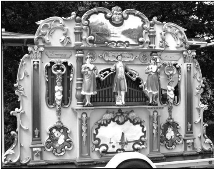
Figure 10. A Limonaire-type Dutch street organ.

One may wonder what is uniquely a Dutch street organ. The answer is obvious. Holland, being mostly reclaimed ocean bottom land, has the only cities with streets level enough for one or two men to push the heavily loaded organ carts around. Many of the Dutch street organs started out originally made in Germany and elsewhere by well-known builders as carnival style organs designed to attract large crowds. These