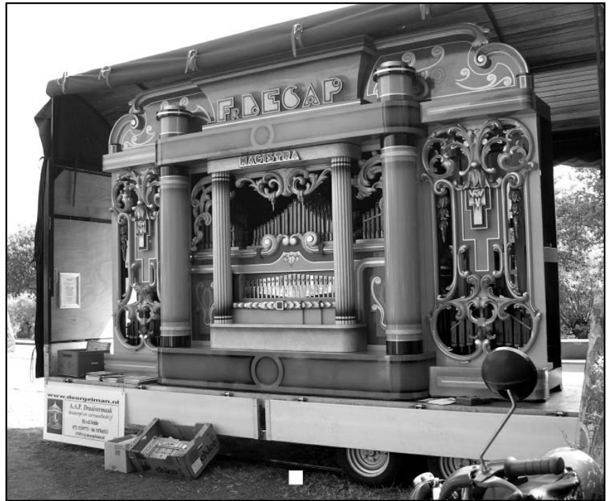
Figure 12. One of several Decap dance organs at the celebration.