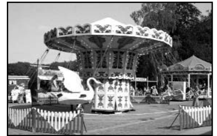
Figure 8. The carnival at the Open Air Museum (Openluchtmuseum) in Arnhem.

Sunday found us at the Openluchtmuseum (Open Air Museum) in Arnhem. The Openluchtmuseum is the Netherlands equivalent to the U.S. Henry Ford Greenfield Village in Michigan. It is a huge park with more than 80 buildings including houses, farm buildings, blacksmiths, a trolley barn, and windmills brought in from different parts of the country. The park has a collection of vintage trolleys that operate on a track that runs the length of the park. The park also has a vintage 1920 style carnival