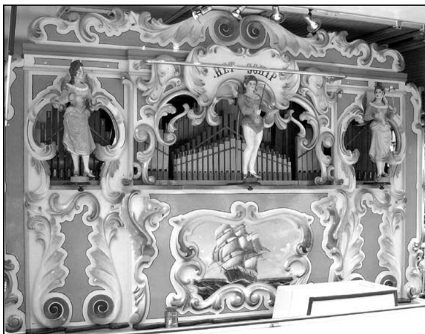
Figure 14. Het Schip is a recently-built Dutch street organ in the Limonaire style.