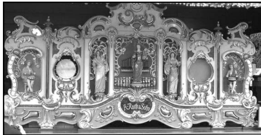
Figure 15. A Model 36A Ruth fairground organ.