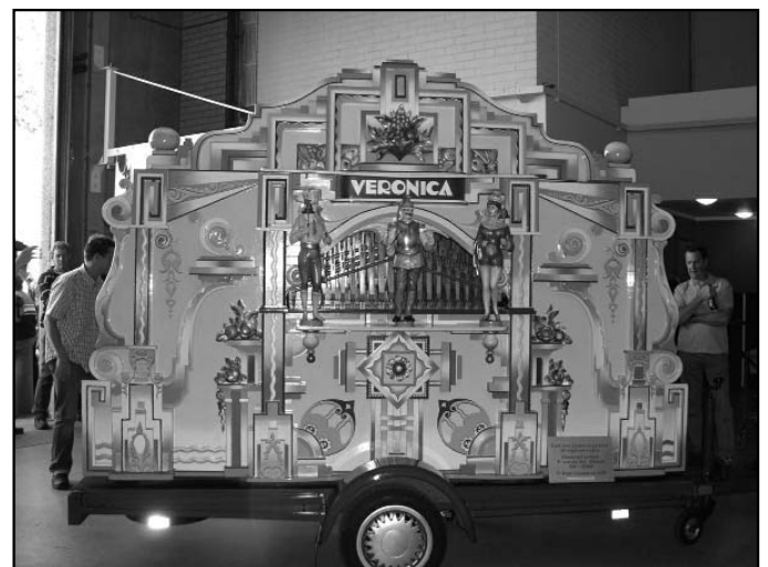
Figure 3. The 52-key Veronica playing at the new Kunkle Museum building.