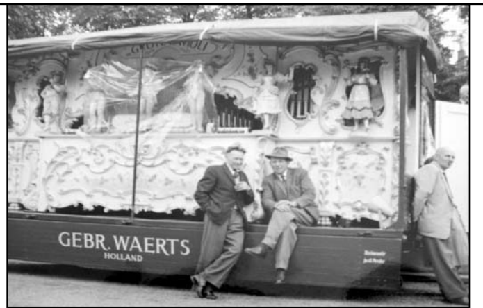
Figure 4. A 1960s photo of De Grote Gavioli showing the Waerts brothers in front of the organ.

Friday afternoon we drove to Tilburg and found it was much larger than we expected. We drove around and around with the windows down trying to hear music. We finally, in