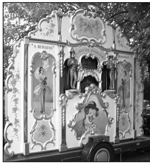
Figure 16. This is 54-key Bursens street organ, built in the 1920s. It is nicknamed Pipo after the famous clown of the 1950s. The lady on the side panels is the Dutch vocalist, Corry Brokken.