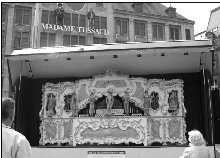
Figure 1. De Grote Gavioli as it appeared in Amsterdam on Dom Square next to the palace.

On Sunday May 30th, we drove to the northern city of Leeuwarden for the Great Organ Event. After driving around for awhile, we saw a circus sign and followed it hoping someone there might know something. At the circus booth was a fellow buying tickets for his family to attend the circus later that day. As luck would have it, he had traveled to the US several times and spoke good English. He used his cell phone to call his sister who happened to know about the organ rally, so he got in his car and led us to the park. Several hours later, we saw him there with his family. He had decided to find out what it was all about.