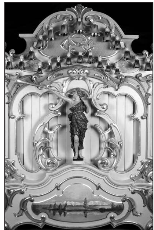
Figure 5. The central portion of the façade after restoration.

The outcome is an exceptionally beautiful instrument of refined tone and quality. As intended, it is two organs in one, since it is able to play both the 66-key B.A.B. music roll and the Wurlitzer 165 music roll.