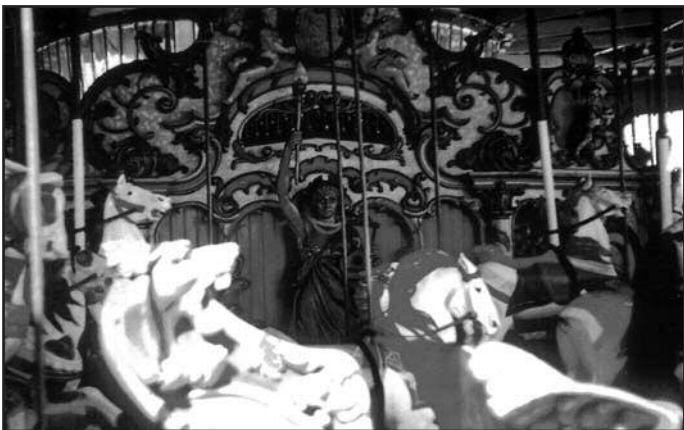
Figure 3. The 80-key Bruder Elite Apollo organ on location at Flushing Meadow.