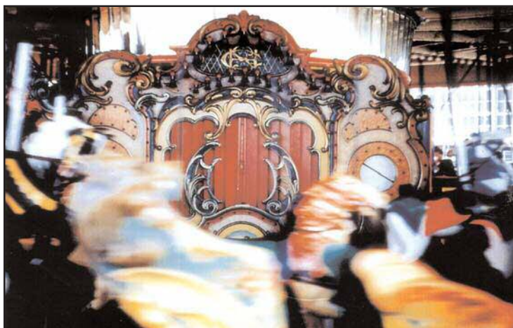
Figure 2. The 65-key Bruder Elite Apollo organ as photographed in 1958 on a Stein and Goldstein carousel.