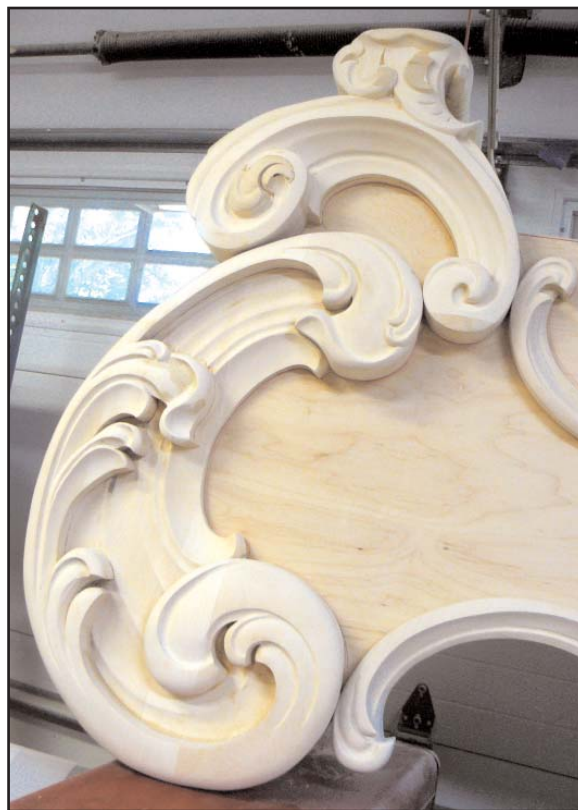
Figure 9. The finished carvings now applied to a façade section.

I have a duplicating machine that will carve a right and left hand carving from a single original master. I set up the right and left band sawn pieces next to the original master (Figure 6). I had to rough out three sets of carvings for the set of three facades (Figure 7). The rough-outs were detailed and finished by hand (Figure 8).