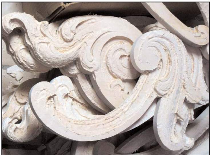
Figure 7. The end result of rough-cutting a band saw blank as seen in figure 6.

I have a duplicating machine that will carve a right and left hand carving from a single original master. I set up the right and left band sawn pieces next to the original master (Figure 6). I had to rough out three sets of carvings for the set of three facades (Figure 7). The rough-outs were detailed and finished by hand (Figure 8).