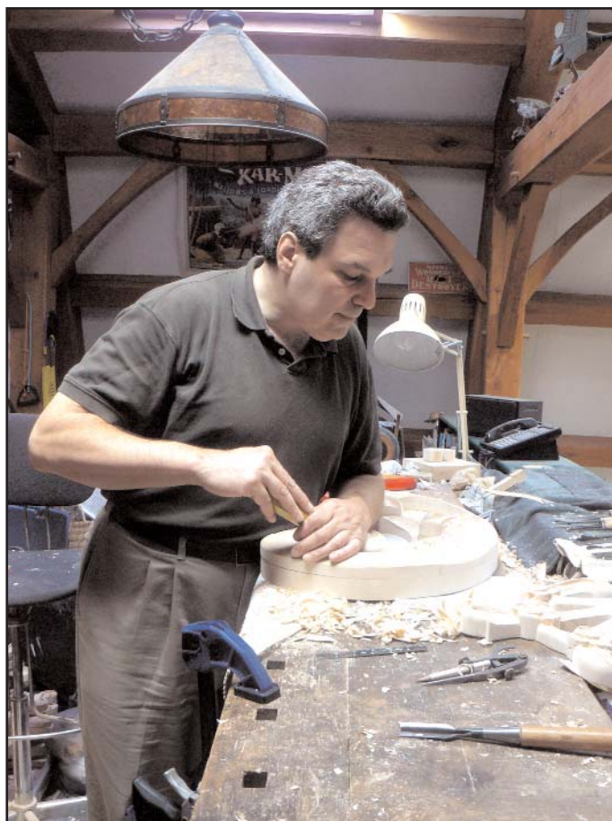
Figure 8. Hand carving by the author adds the details and smoothness to the carved components.