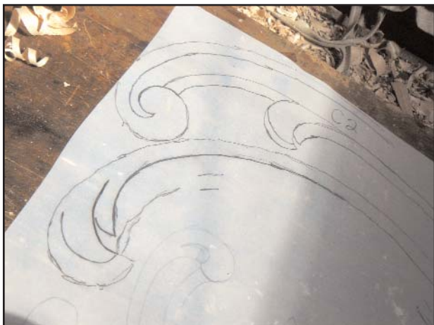
Figure 2. A sampling of the tracings needed.