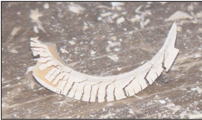
Figure 3. An example of brittle wood not giving crisp detail.

Now I needed wood. Being a bit finicky by nature, I wanted the best I could get. Tight growth rings take the best detail so that implied Northern grown. Most wood is available kiln dried, which I find to be brittle thereby not giving the crisp detail that I desire ( Figure 3 ). A trip to a friend who mills basswood from Northern Minnesota and Wisconsin was in order. I told him what I wanted, which they only cut in the winter when the sap is not running. I arrived and loaded up a truck. I like my stock to dry for at least a year, then plane and dimension it. Working with this type of wood yields crisp detail with nice chips.