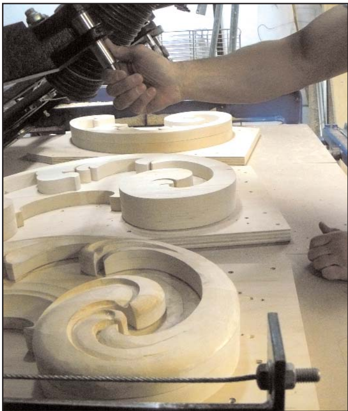
Figure 6. Using the duplicating machine to rough-carve the decorative scrolls.

needed Wurlitzer 165 carvings. This implied that the best approach was to carve a complete set of carvings to have as models.