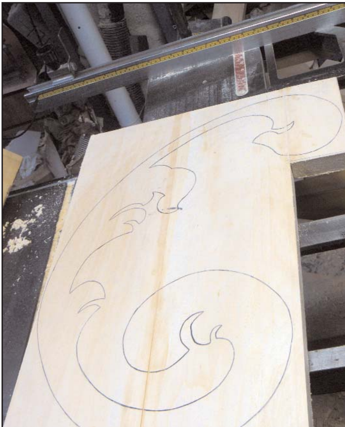
Figure 4. Glued-up pieces of basswood with patterns applied.

I found some terrific furniture grade maple plywood with no voids or patches one inch thick for the façade panels. The panels were laid out and rough cut slightly over size. The carved components were glued, traced and cut out on a band saw to the exact dimensions. Each piece had to be carved so that it mimiced the original Wurlitzer carvings.