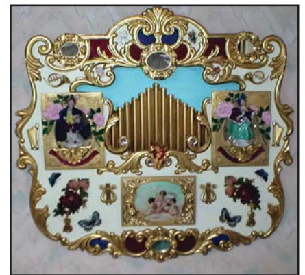
Above are four different examples of band organ facades made with various materials I have found.