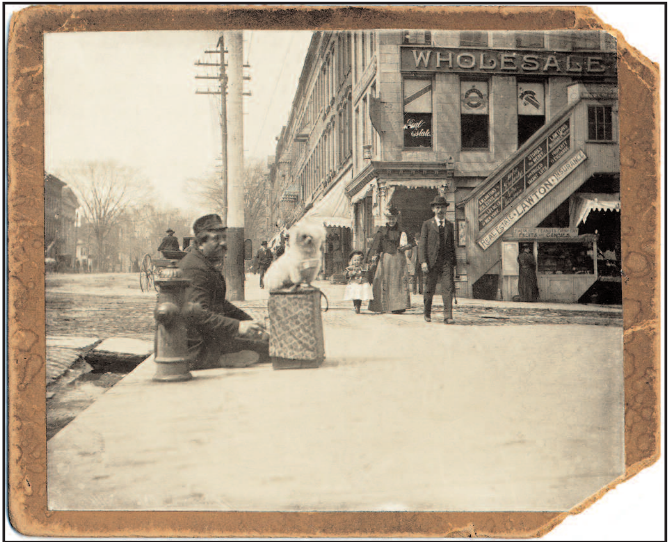
The organ grinder of Auburn, NY.